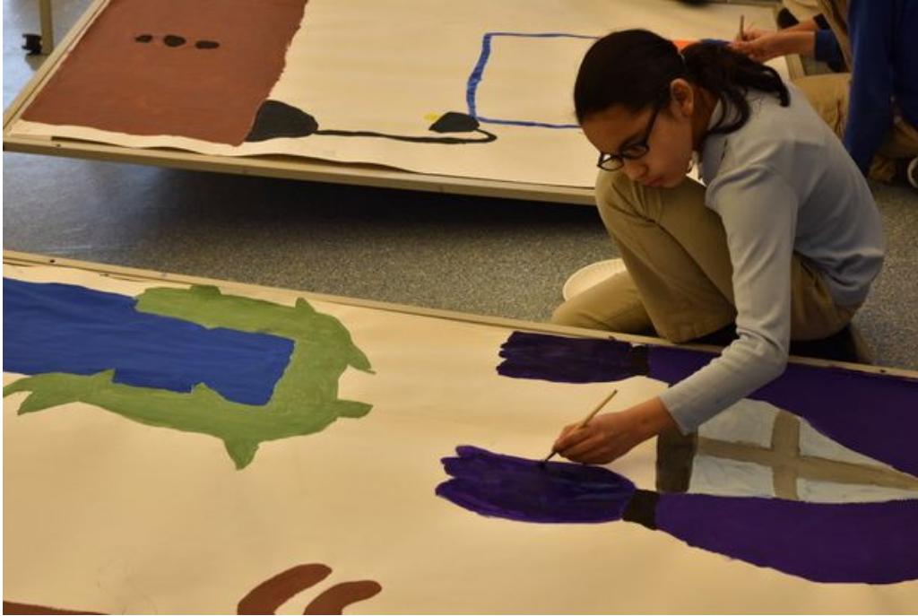
VISUAL ART TROUPE