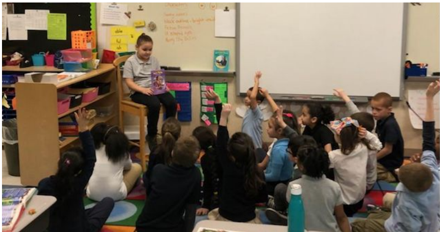
Below is a sample of grade 4 and 5 students doing a lesson integrating drama and language arts.